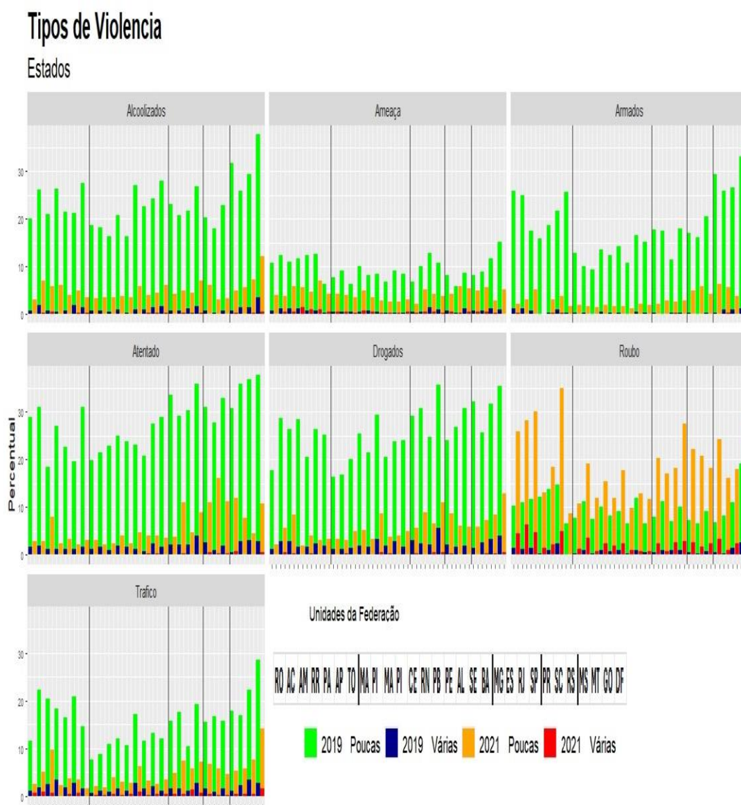
Graph 1 – Types of Violence by State

With regard to the comparison between years, the columns represent the accumulated percentage of percentage responses given by the frequencies Little and Several times for the years 2019 and 2021 according to the states in the order established in the legend. Thus, when comparing the sizes of the columns, it reflects the accumulated occurrence of events according to the frequency observed by the managers (Few + Several), for each referenced type of violence, in the different years and states.