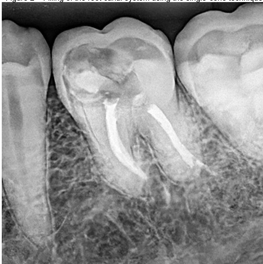
Figure 2 – Filling of the root canal system using the single-cone technique