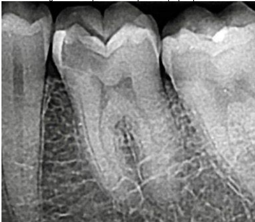
Figure 1 - Deep caries with possible pulp exposure

After anesthesia, the tooth was isolated and coronary access was performed using a 1014 diamond drill (KG Sorensen, Cotia, SP, Brazil). Irrigation was performed with 2% chlorhexidine. After exploration of the root canal, radiographic odontometry was performed.