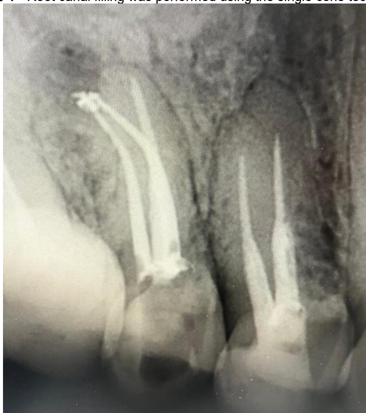
Figure 1 - Root canal filling was performed using the single cone technique.

Three canals were prepared using Sequence Niti rotary instruments (MK Life) to #25.06, and the root canals were irrigated with 2,5% sodium hypochlorite solution. Root canal filling was performed using the single cone technique associated with Bio-C Sealer cement and 25.06 taper gutta-percha tip were used. The postoperative X-ray showed that all the 3 canals were filled (Figure 1).