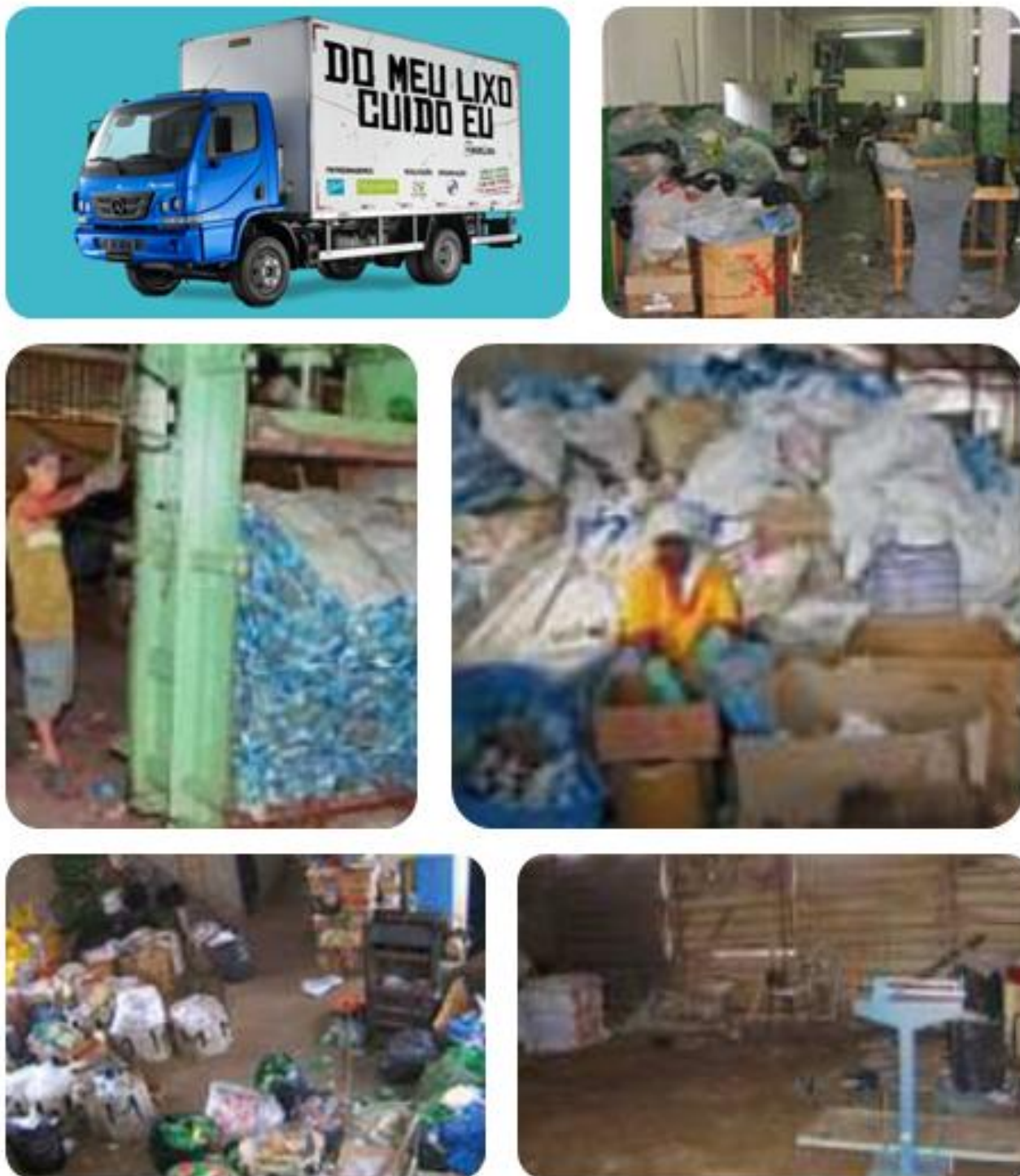
Figure 4: Photograph of a recycling truck, shed and materials