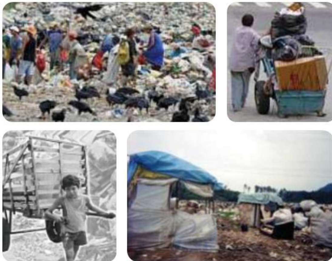
Figure 9: Photograph of the waste picker work in a "garbage dump" and on the streets