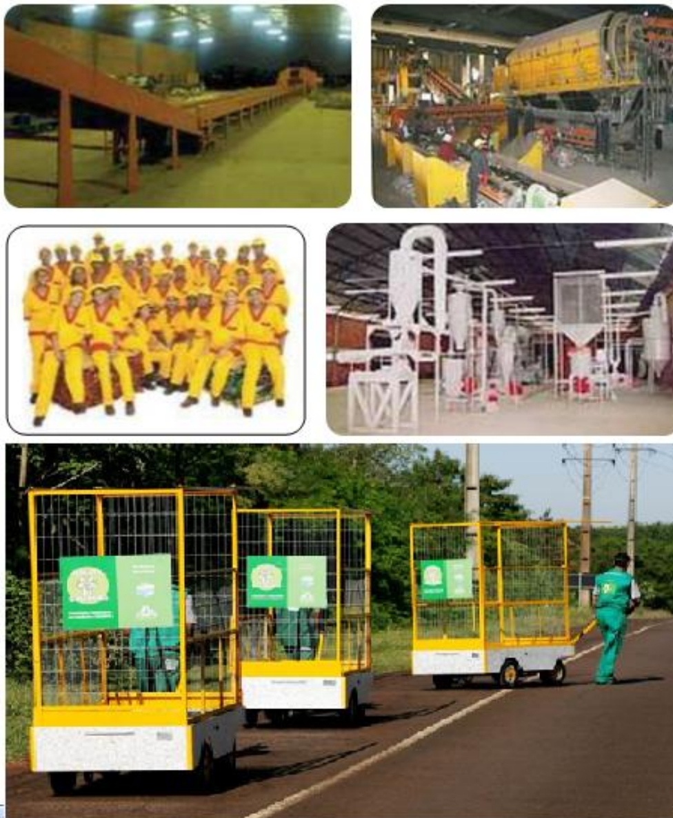
Figure 2: Photograph of the belt, trolley and uniformed workers