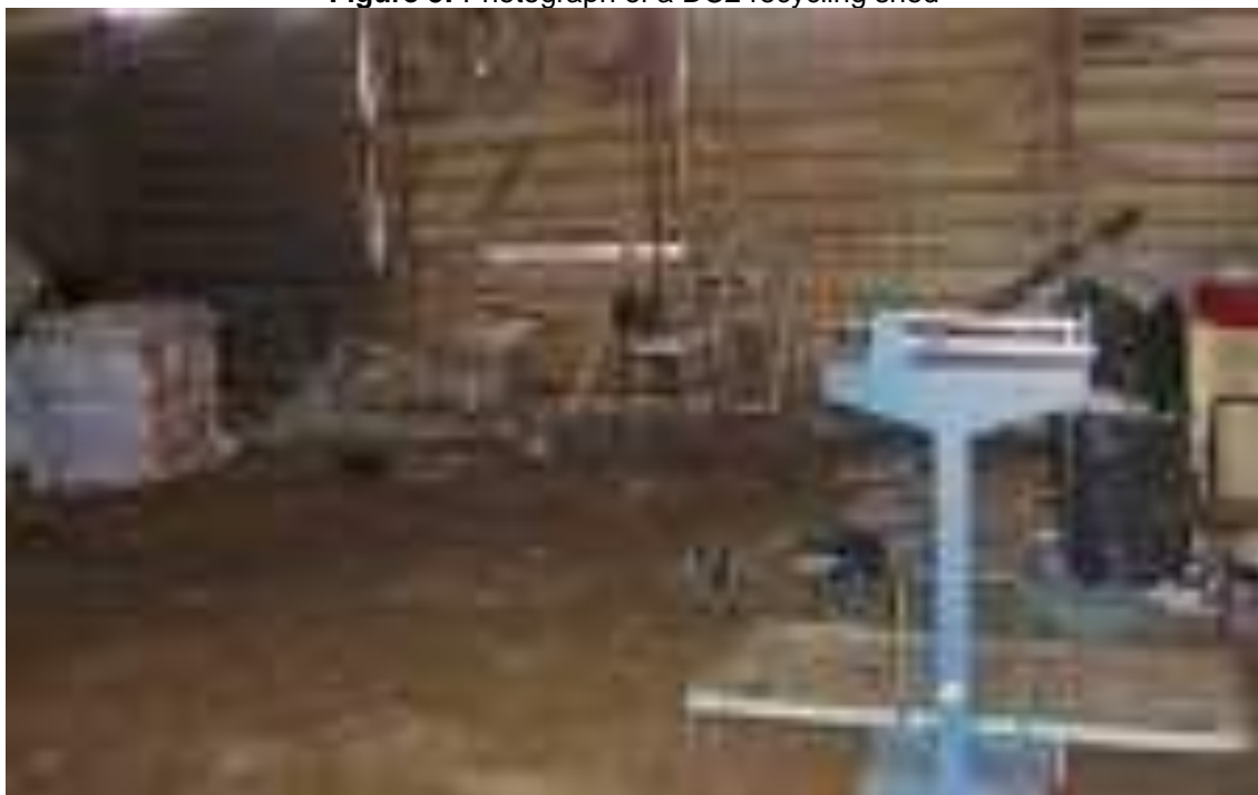
Figure 5: Photograph of a DC2 recycling shed