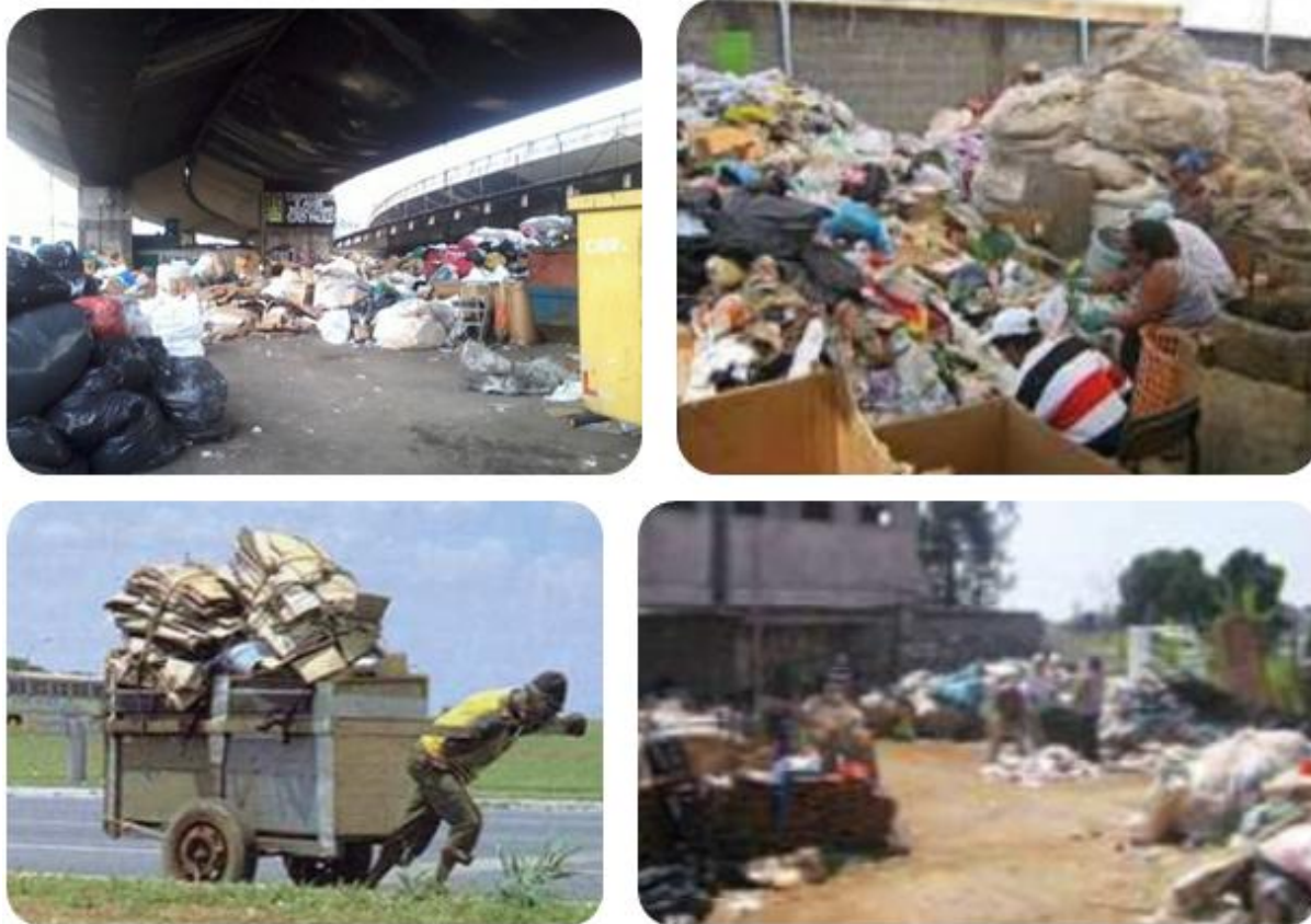
Figure 6: Photograph of DC3 recycling shed