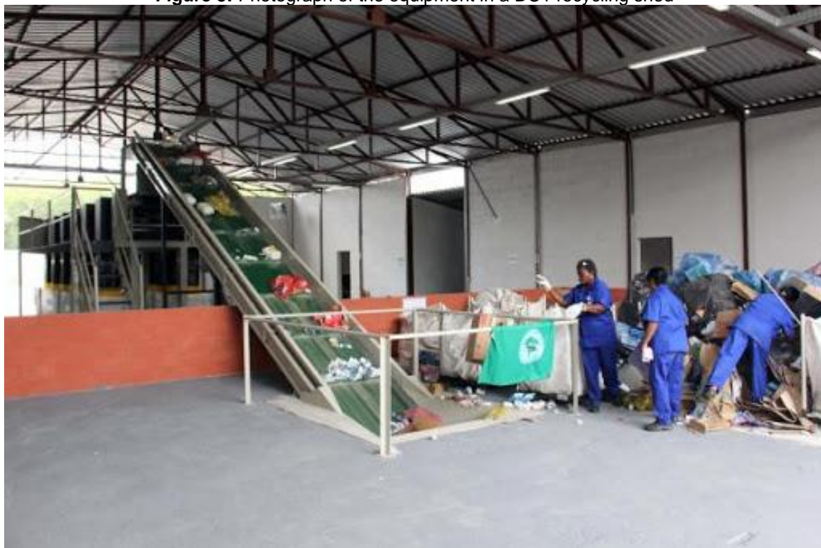
Figure 3: Photograph of the equipment in a DC1 recycling shed