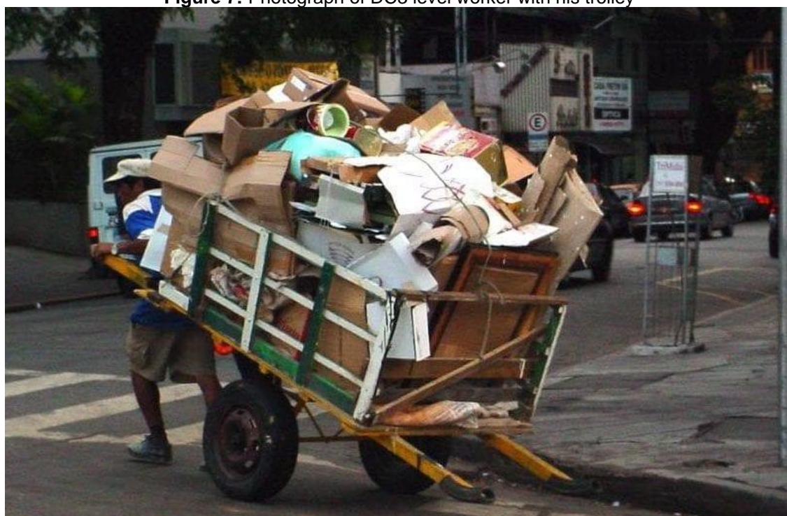
Figure 7: Photograph of DC3 level worker with his trolley