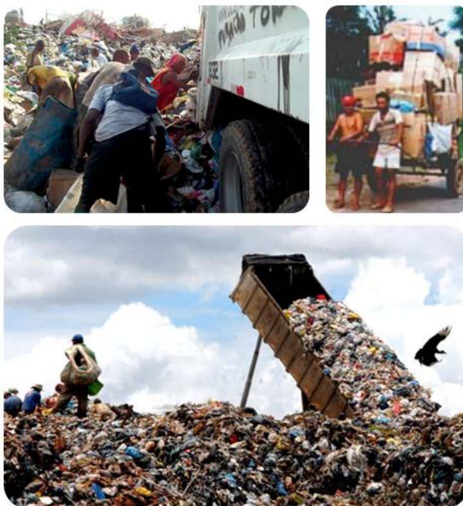
Figure 8: Photograph of workers looking for recyclables in a "dump"