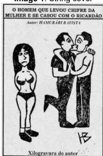
Image 1. String cover