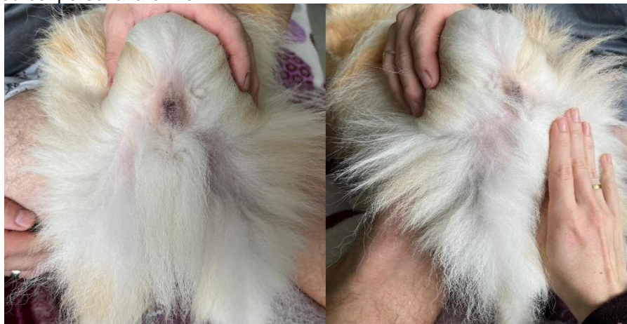
Figure 1: Images of the patient presenting bilateral symmetrical hair thinning on the caudal aspect of the thighs and perineum.

After the evaluation, the owner was asked for authorization to perform additional tests: complete blood count, albumin, ALT, creatinine, cholesterol (total and fractions), cortisol (immunofluorescence), triglycerides, TSH (immunofluorescence) and free T4 (chemiluminescence), in addition to skin cytology and trichogram, in order to rule out signs of endocrine diseases that are incriminated in cases of alopecia (table 1).