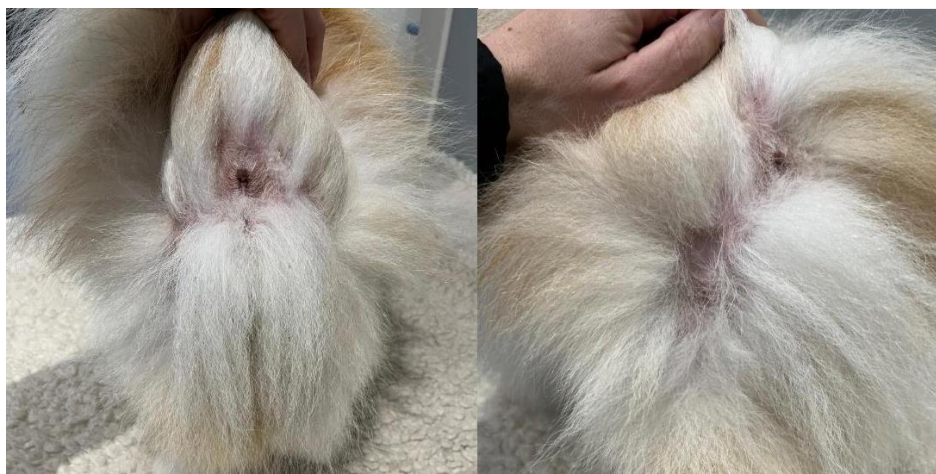
Figure 2: images of the alopecic areas showing partial hair regrowth after 90 days of treatment.

Given the partial positive result of therapeutic response, the use of melatonin was extended for another 2 months, together with the Qpelo food supplement to aid in hair growth, until further instructions.