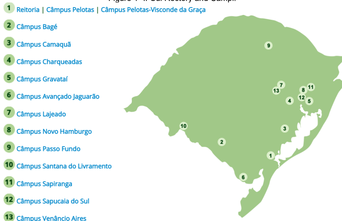
Figure 1- IFSul Rectory and Campi.

Thus, this article sought to contribute to filling these gaps, by analyzing in detail the experiences of students in IFSul's PROEGA, their difficulties, and possible institutional solutions to improve the rates of permanence and success.