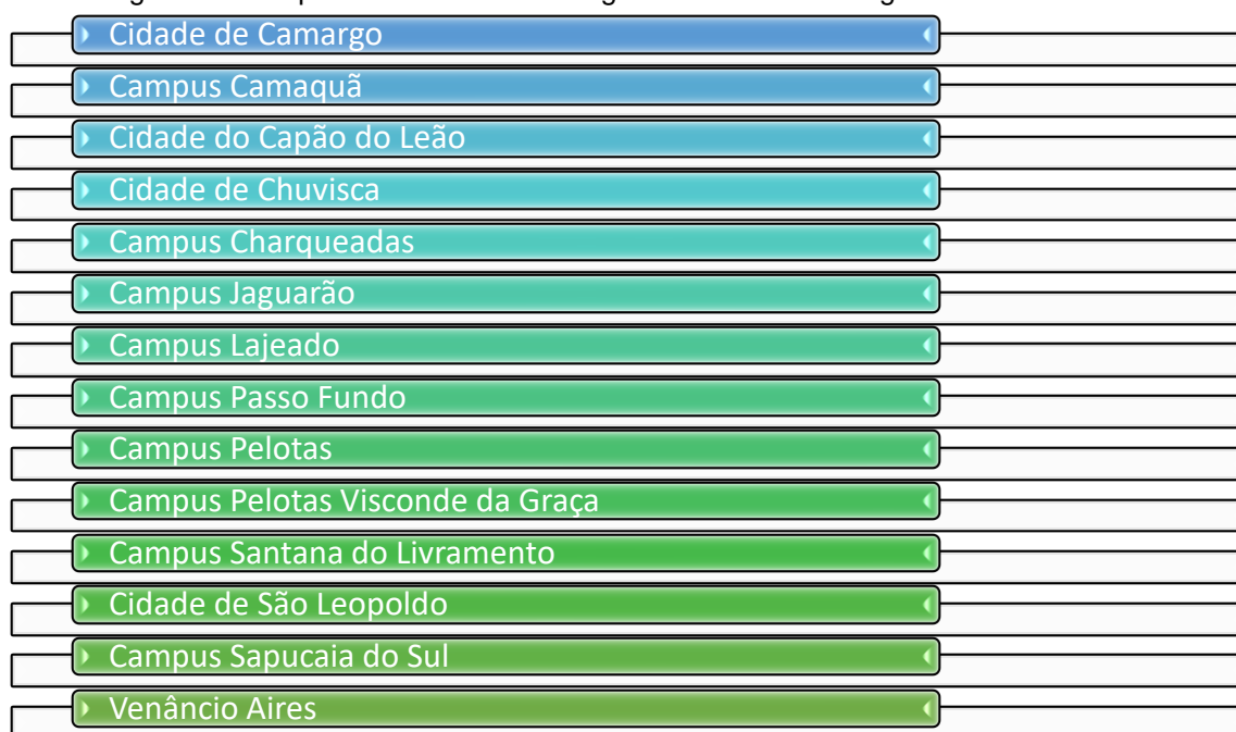
Figure 4 - Campuses and Cities offering Initial and Continuing Education courses.

The results obtained by IFSul corroborate the guidelines presented throughout the article, highlighting the importance of continuous teacher training as a critical factor for the success of Youth and Adult Education. Previous studies indicate that the training of