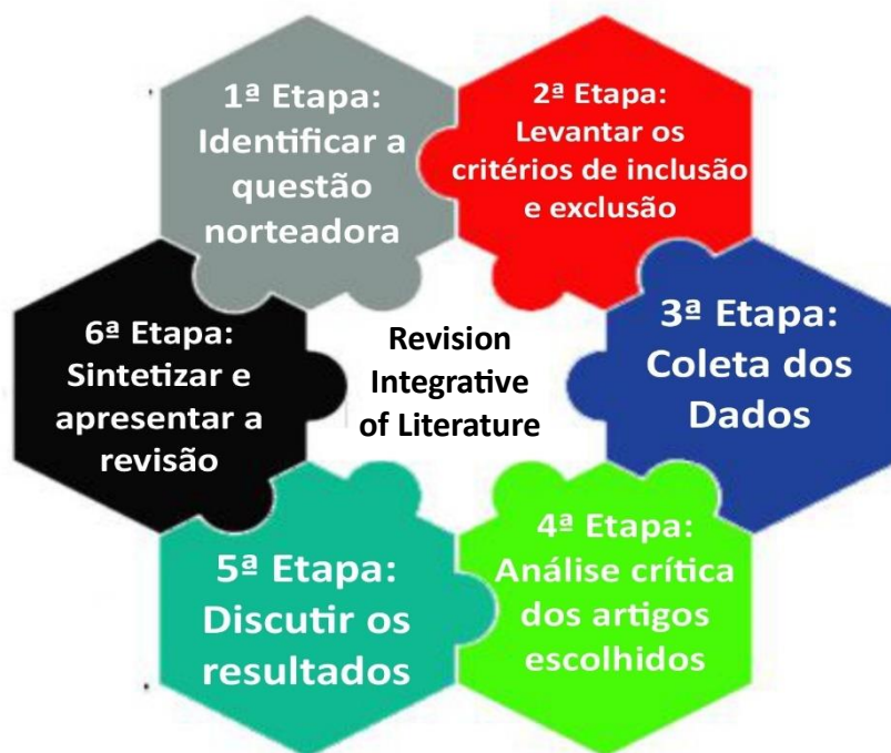
Figure 1 – Flowchart of the stages of the Integrative Literature Review