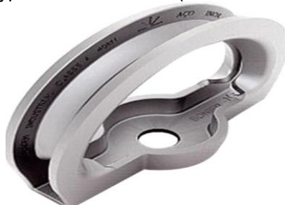
Figure 1: Type A1 Anchor Point. (JRV SERVICES, 2017).

Type A2: It differs from the type A1 anchoring device in that it is designed to be fixed to pitched roofs (NBR, 16325a, 2014).