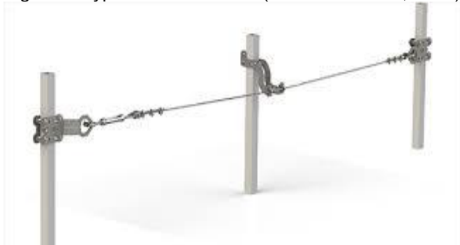
Figure 4: Type C Anchor Point. (JRV SERVICES, 2017).

Type D: This model of anchoring device employs a rigid anchor line that does not deviate from the horizontal plane by more than 15°. It is a rigid line made of metal rail, through which a trolley slides PPE must be connected to the trolley via an anchor point. Figure 5 exemplifies the type D anchor point model (NBR, 16325a, 2014).