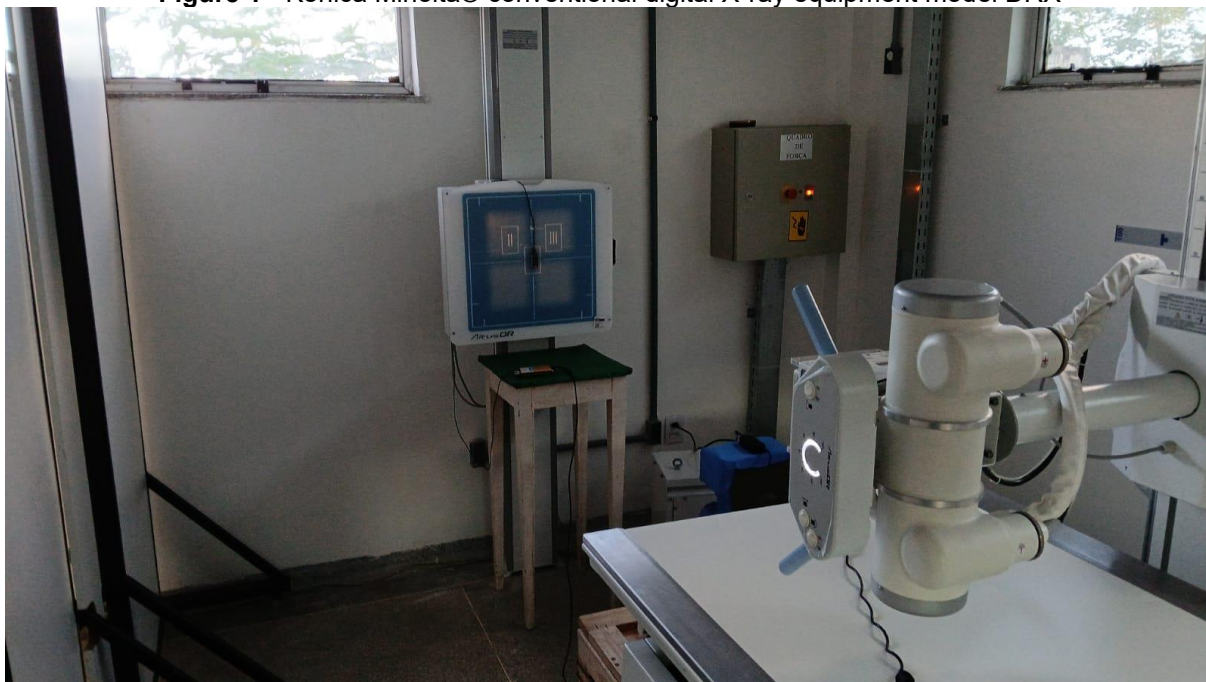
Figure 1 - Konica Minolta® conventional digital X-ray equipment model DRX