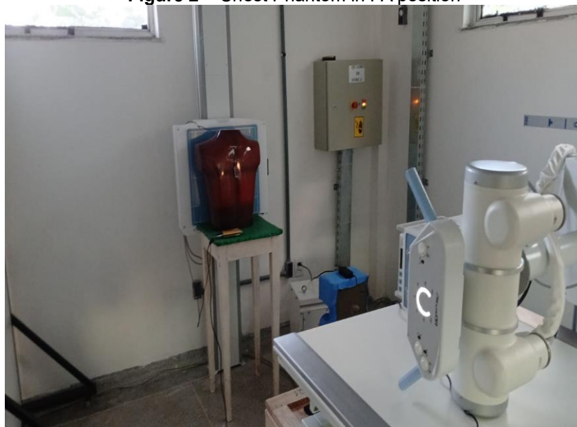
Figure 2 – Chest Phantom in PA position

To simulate the presence of the patient, a commercial Pixy Phantom model RSD 101 (Figure 2) and an X-ray measurement system with an ionization chamber and solid-state dose sensors specific for X-rays, model RADCAL® Accu-Gold (Figure 3), were used.