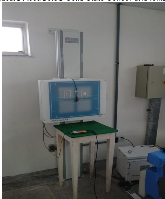
Figure 3 – Radcal® AccuGold® Solid State Sensor and Ionization Chamber