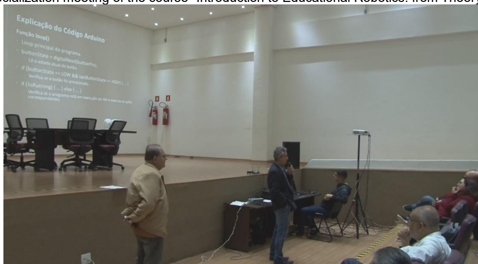
Figure 2. Socialization meeting of the course "Introduction to Educational Robotics: from Theory to Practice".

and the results of this project should be socialized with the other participants of the course. Figure 2 shows the socialization meeting of the basic level course.