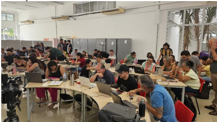
Figure 1. Face-to-face activity of the course "Introduction to Educational Robotics: from Theory to Practice".