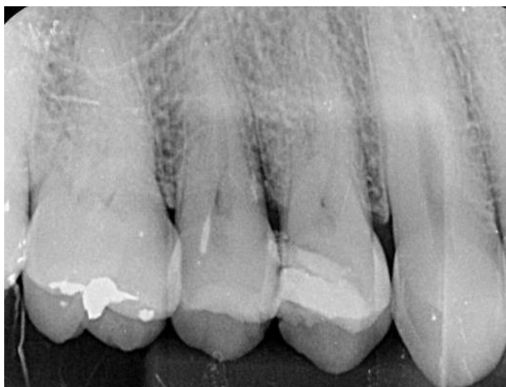
Figure 1 - Presence of 3 root canals of the upper right first premola

Treatment, discovery, and confirmation of three root canals: Root canal therapy of left upper first premolar. Informed consent was obtained from the patient. Epinephrine-containing lidocaine local infiltration anesthesia for dental procedures, with the rubber septum. In the maxillary left first premolar, the pulp was accessed following pulp exposure, and the mesiobuccal root canal was detected using the DG-16 probe. The triangular access cavity of this premolar resembled that of a molar and three distinct orifices were located corresponding to three canals. Mesio-buccal (MB) and disto-buccal (DB) orifices were located in close proximity to each other and the palatal orifice was found to be located in line with the palatal cusp tip.