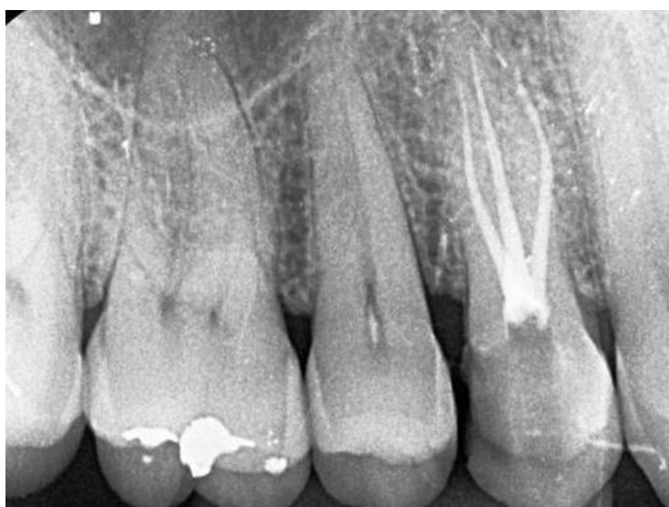
Figure 2 - Root canal filling was performed using the single cone technique.

Three canals were prepared using ProTaper Niti rotary instruments (Den Berg, USA) to F2, and the root canals were irrigated with 5.25% sodium hypochlorite solution. Root canal filling was performed using the single cone technique associated with Bio-C Sealer cement. AH-plus Jet and F2 06 taper gutta-percha tip were used. The postoperative X-ray showed that all the 3 canals were filled (Figure 2).