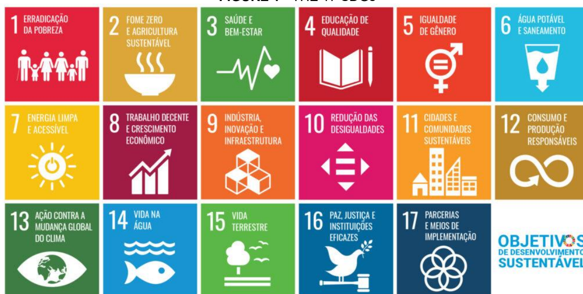
FIGURE 1 - THE 17 SDGs

These targets were replaced by the Sustainable Development Goals (SDGs) in 2015, which comprise a set of 17 broader and more ambitious goals to be achieved by 2030.